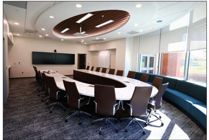
Conference room at U.S. Army War College, Carlisle, Pa.

As of August 2024, the Furnishings Program manages on average 280 active projects, and of those projects 96 percent were completed on time and within budget. Feedback received from centrally funded customers continues to be positive and include consistency of furnishings purchased, higher quality of product which equals a long-life cycle duration and cost avoidance. With the reduction in government spend plans, longer life cycle duration and cost avoidance are key factors to ensure facilities can continue to be occupied. Historically, the program receives upwards of 15 percent in annual cost savings due to the volume of orders executed through the Furnishings Program. These savings are redirected to unfunded requirements provided by customers.