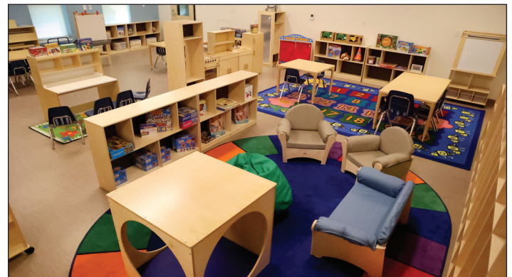
Child Development Center classroom at Fort Wainwright Fairbanks, Alaska.