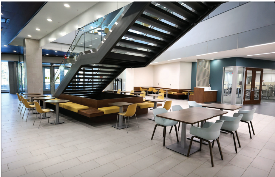
New collaborative entry way at the U.S. Army War College, Carlisle, Pa.

The Furnishings Program provides a full-service project-delivery process that includes technical support and acquisition support while adhering to scope, schedule and budget. Our in-house interior designers allow Huntsville Center to provide design services and technical support for our customers to ensure a furniture solution that maximizes space utilization and efficiencies, standardization solutions and quality assurance programs. The design services and solutions provided through the Furnishings Program can be packaged to provide procurement and install services as a turnkey solution.